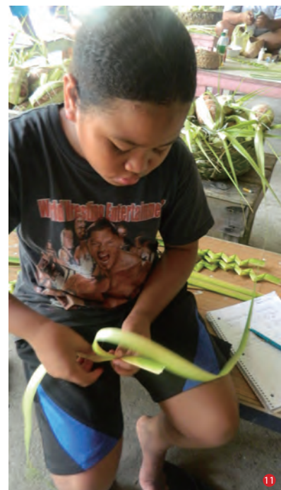
13. Lkul a dui is an allocated taro field for a clan; thus, the wife of a chief tends and harvests this taro field for her husband's taro consumption and other clan-related customs. See "Taro Field Landscape" in this publication for a description of lkul a dui .

Crops such as taro, giant taro, and tapioca play a central role during omesurech and omengat . Food preparation involves the family, clan, and sometimes the village. Women work cooperatively to make billum (boiled, grated tapioca). In addition, taro is prepared to be boiled. Fish and pig are traditionally prepared by the men. Men go